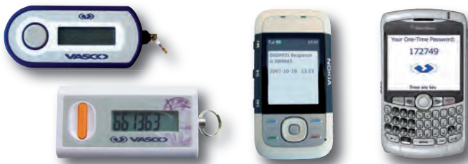
Digipass Go 6, Digipass Go 7, Virtual Digipass, Digipass Mobile

datec24 and Vasco – two strong co-operation partners for IT Security